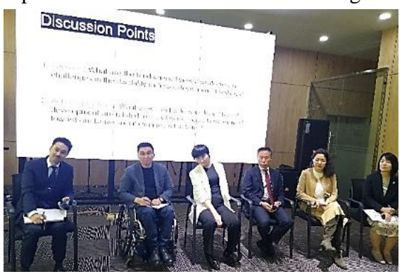
The Joint Session

NUM and ARIISW also held a joint session, entitled 'Policy and practice in disability and development towards inclusive social change: